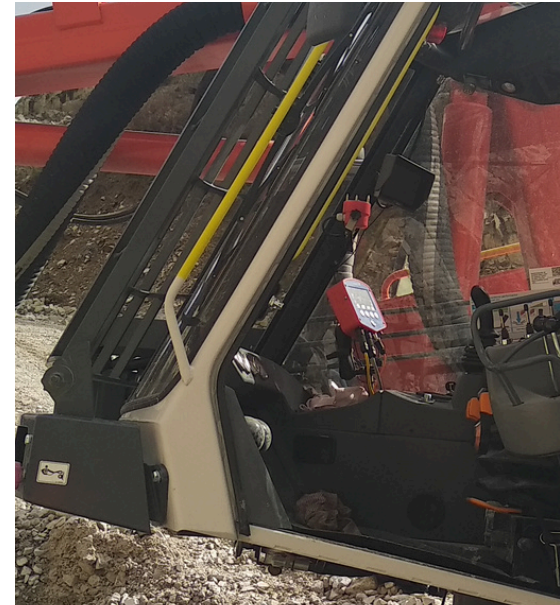
PocketLIM in a SANDVIK cabin.