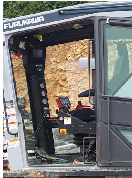
PocketLIM in a FURUKAWA cabin.