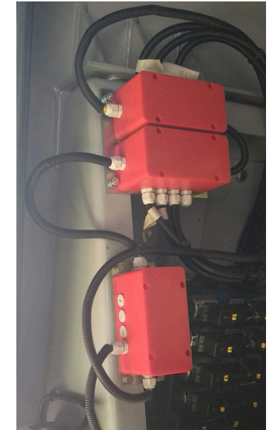
CANBUS LIM interface boxes

Thanks to its technology, the PocketLIM , which has two CANBUS inputs, can easily be connected to the various CANBUS (CAN open) networks of the drilling machine. All the drilling rigs used by the company Nxx whether they are Epiroc, Sandvik, Furukawa, TMB use CAN BUS technology to retrieve information from the various measurement sensors present on the machine.