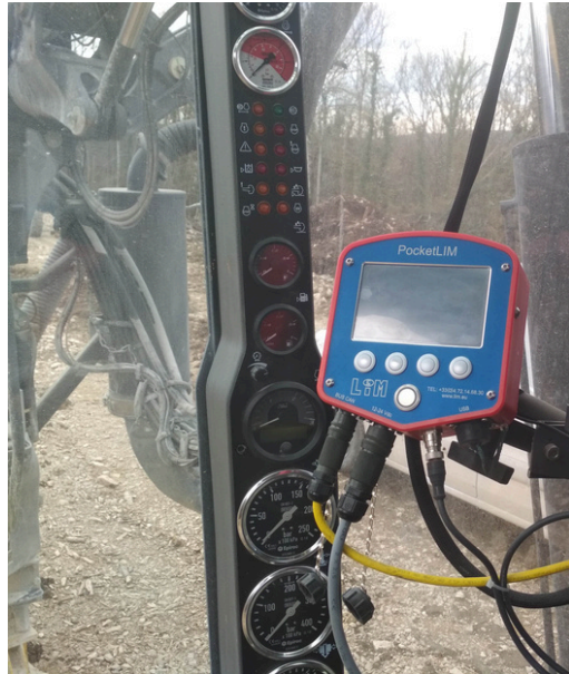
PocketLIM in an EPIROC cabin.