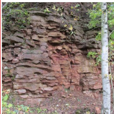
Outcrop of iron-bearing "Minette" formations

The probe used also provided a natural gamma log.